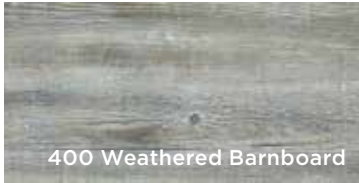
400 Weathered Barnboard