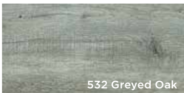
532 Greyed Oak