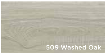
509 Washed Oak