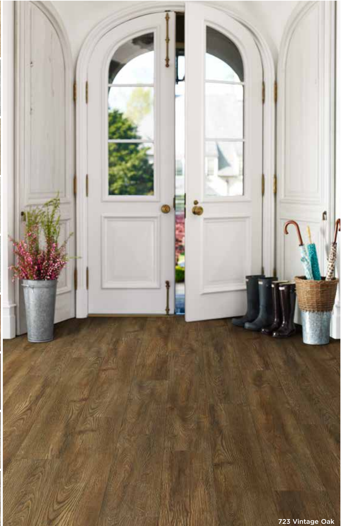
723 Vintage Oak