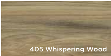
405 Whispering Wood