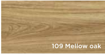
109 Mellow oak